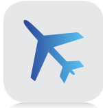
INTERNATIONAL AIRPORT "IL CARAVAGGIO" Orio Al Serio

The airport Il Caravaggio - third in Italy for number of passengers (in 2015 over 10 millions), and for goods transported – with over a hundred daily flights, connecting Bergamo with the whole Europe and parts of North Africa.