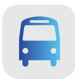
BUS SERVICE BERGAMO Bergamo

Close to the city center, Bergamo hosts the Railway Station, outside which there is an efficient network of buses that in a short time allows the connection with the Fair.